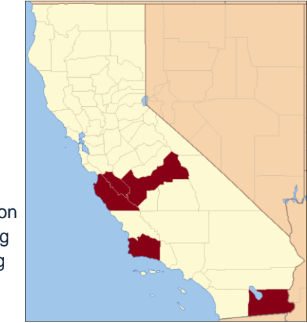
Figure 2: Location of the five leading lettuce producing counties in California <sup>[13]</sup>.

In 2007, 57% of the lettuce produced in California came from fields in Monterey County, where lettuce is harvested from spring to fall. During the winter months, lettuce is predominantly produced in Imperial County, which accounted for 13% of the lettuce production in California in 2007<sup>[13]</sup>. Therefore, these two counties together produce 70% of California's the lettuce, which corresponds to more than half of the lettuce produced in the U.S. With a share of roughly 5% each of the total production, San Benito, Santa Barbara, and Fresno Counties are other important lettuce producing counties (Figure 2)<sup>[13]</sup>.