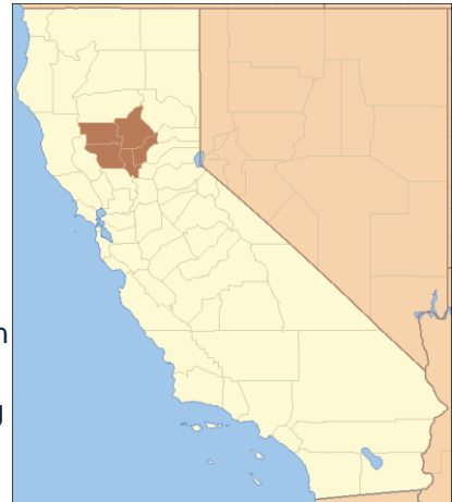
Figure 2: Location of the five leading rice producing counties in California [3] .

In the Sacramento Valley, rice is grown on soils with a high clay content or a restrictive layer, which reduce water infiltration. These soils are ideal for rice production, but less favorable for other crops. Rice production in the San Joaquin Valley is small mainly because crops which return a higher income per acre can be grown on the more fertile soils there. In addition, the water supply is more restricted in the San Joaquin Valley compared to the Sacramento Valley [5] .